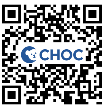
View Your Plan's Information

Investment advisory services offered through OneDigital Investment Advisors LLC ("OneDigital"). Please note that transaction requests received via email, facsimile, voicemail or text will not be accepted due to OneDigital's inability to authenticate the identity of the sender. All transaction requests must be communicated personally to your OneDigital Investment Adviser Representative ("Advisor"). If you are a client of OneDigital and encounter events that may impact your financial situation or investment objectives, want to change your communication preferences, or would like to impose, add and/or modify restrictions to the investment advisory services you receive from OneDigital, please contact your Advisor. To ensure compliance with applicable Internal Revenue Service regulations, any tax advice contained in this email was not intended or written to be used, and cannot be used, for the purpose of avoiding penalties under the Internal Revenue Code. Securities offered through Osaic Wealth, Inc. (Osaic) (member FINRASIPC). OneDigital and Osaic are independent and unaffiliated entities.